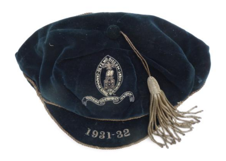
Rugby "honours cap" from 1932