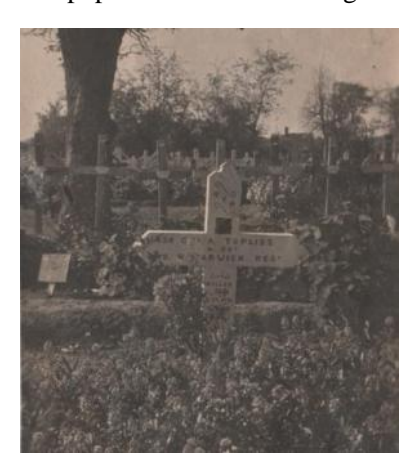
The first cross on Arthur Topliss's grave, probably at a temporary interment in Epehy Wood Cemetery (see p.16)